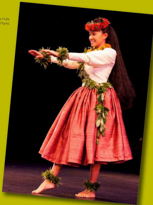
Kū Mai Ka Hula.