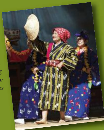
Okinawan Festival

Kauai Marathon.