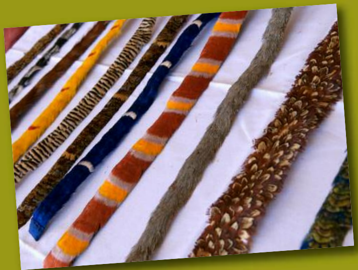
Cultural demonstrations including lei hulu (feather lei) making workshops at Festivals of Aloha, Maui Nui Style - Lāna'i.

(808) 226-2697 or www.slackkeyfestival.com