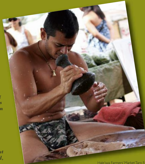
Hale'iwa Farmers' Market Taro Fest

(808) 528-0506 or www.hawaiiitheatre.com