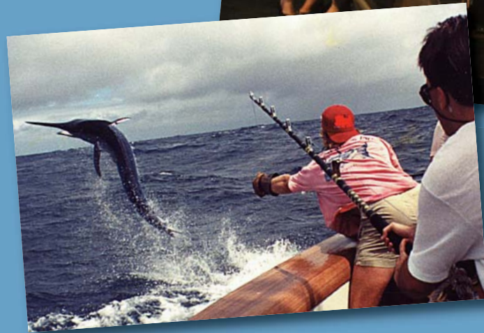
Hawai'i Marlin Tournament Series.