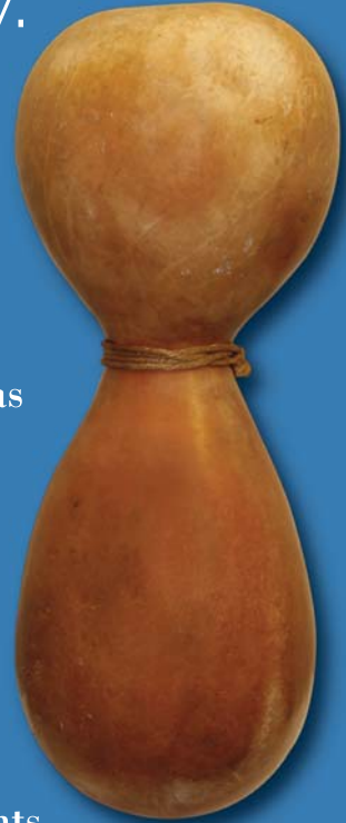
Ipu Heke (Hula implement made from gourds)

Hula is the art of traditional Hawaiian dance that's been used centuries ago in ancient Hawai'i for religious purposes. Today, hula has evolved into one of the world's most unique dance forms used to tell stories about Hawai'i's rich history and stories of people, places and things. Whether accompanied by an oli (chant), mele (music) or implements, both hula kahiko (ancient) and hula 'auana (modern) are the islands' messages of aloha that have captured the world's attention and continue to be honored today through festivals and events including the Prince Lot Hula Festival and Queen Lili'uokalani Keiki Hula Competition both held in July.