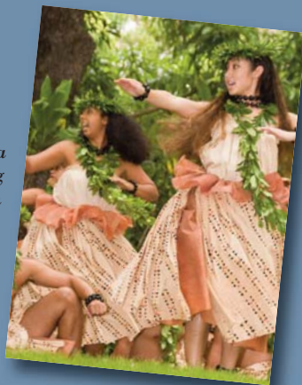
Prince Lot Hula Festival.