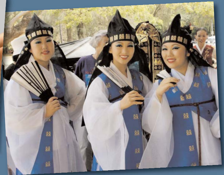
Korean Festival.

(808) 599-0211 or www.koreanfestivalhawaii.com