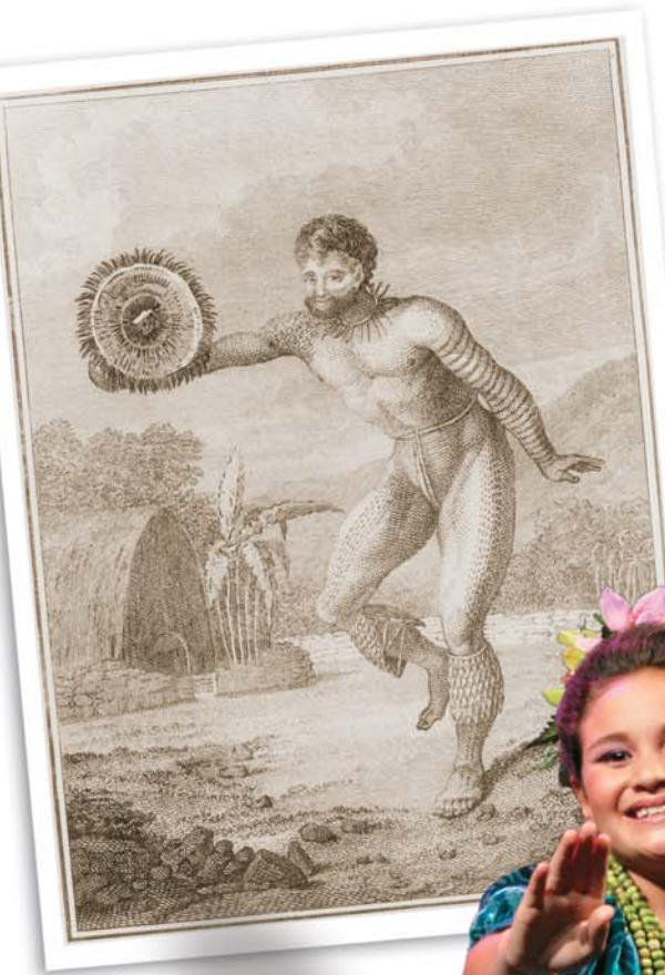
A Celebration of Cultures and Traditions in the Islands